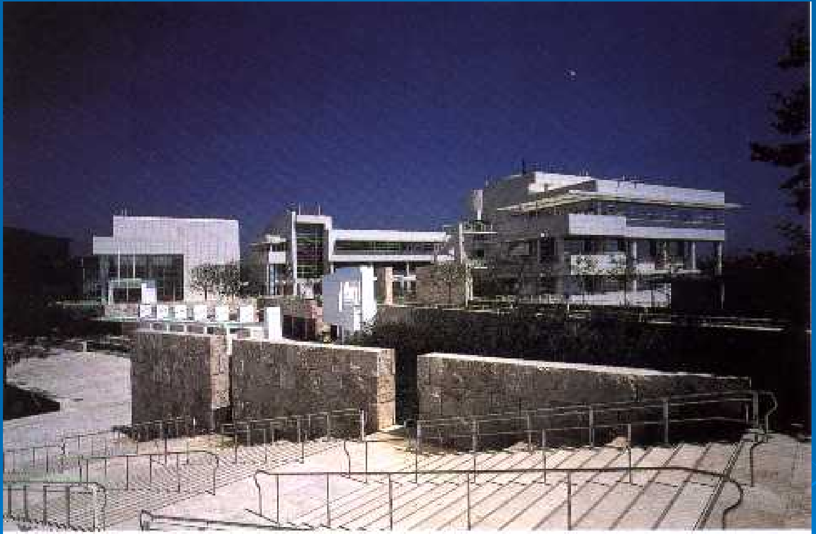
RICHARD MEIER, GETTY CENTER, LOS ANGELES, 1984-1997