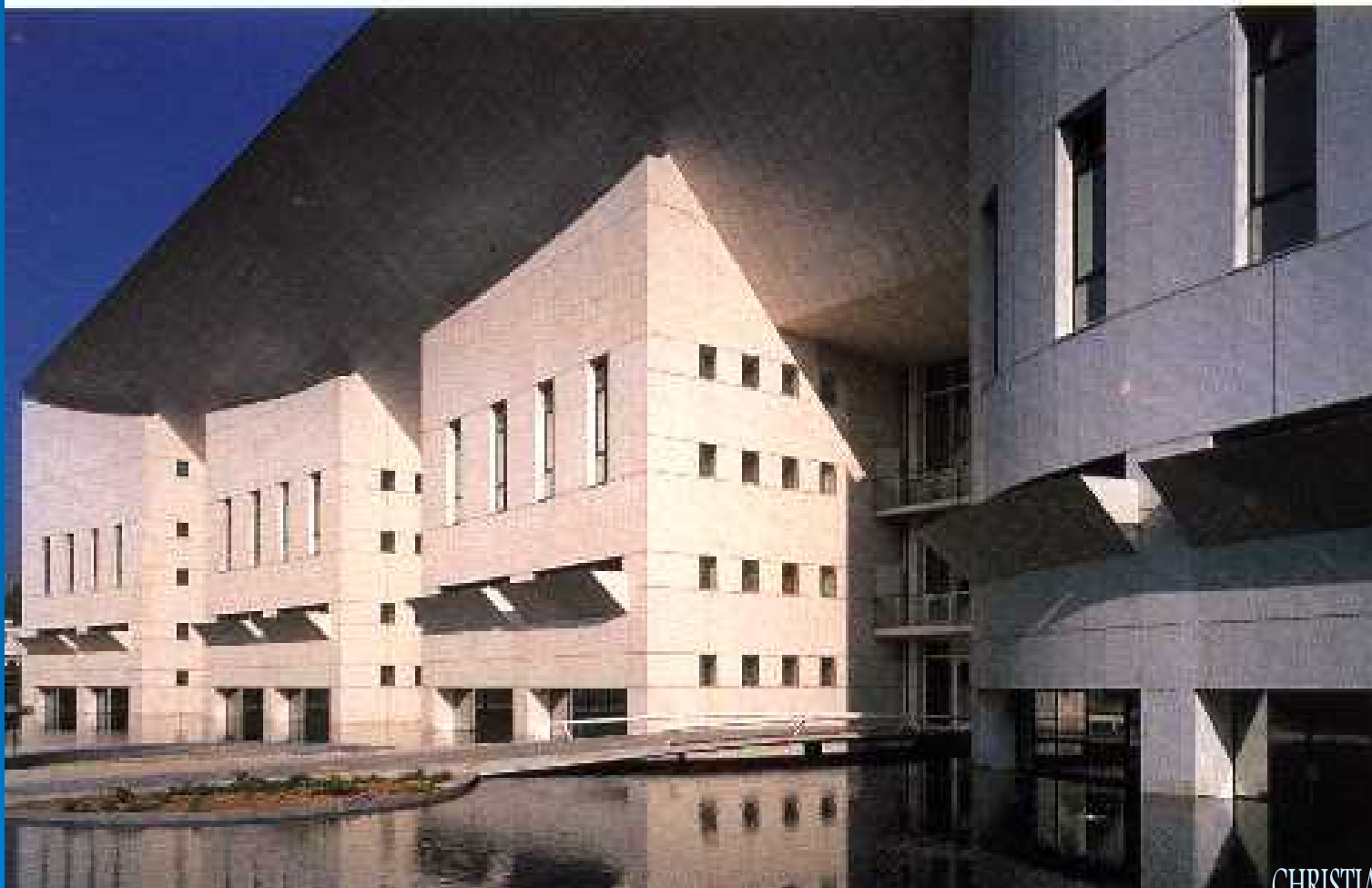
CHRISTIAN DE PORTZAMPARC, CITE DE LA MUSIQUE, LA VALITTE, PARIS,