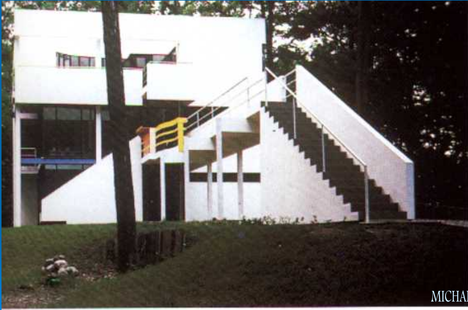
MICHAEL GRAVES, HANSELMANN HOUSE, INDIAN,