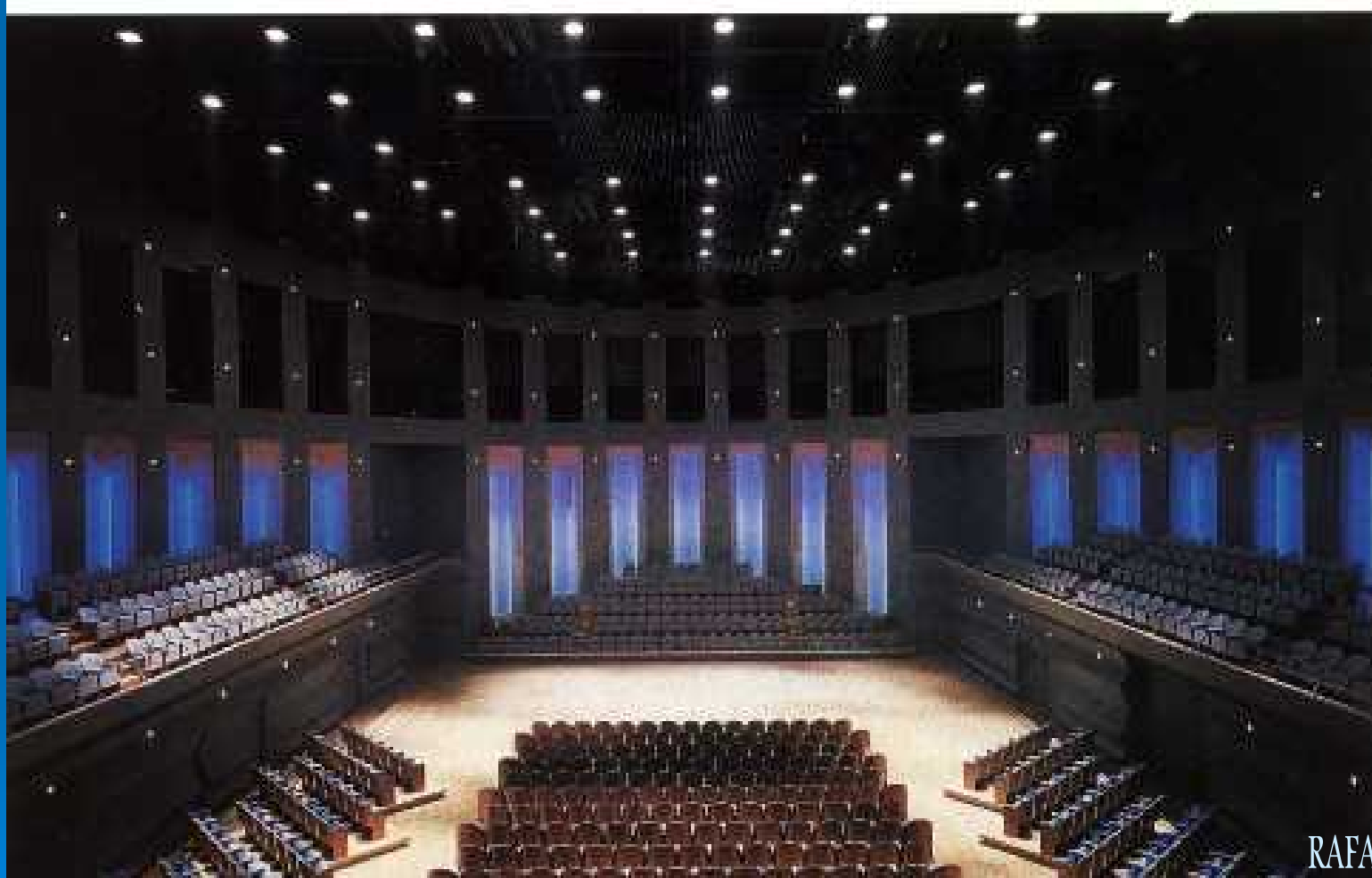
RAFAEL VINOLY, TOKYO INTERNATIONAL FORUM, 1990-1996