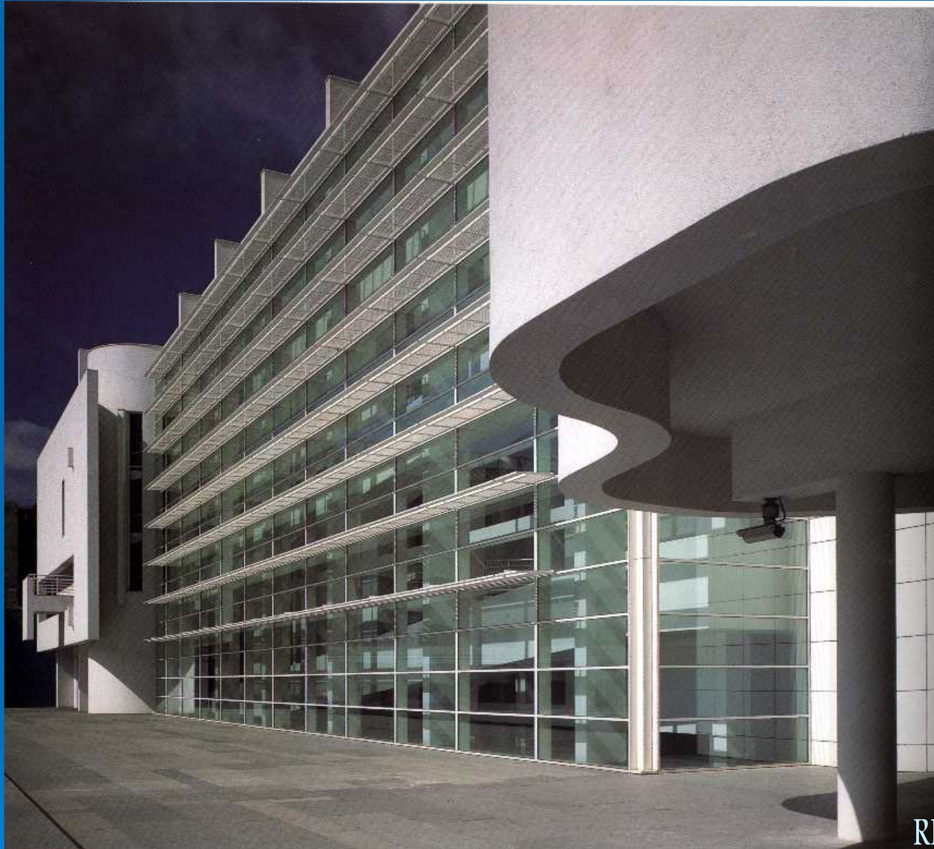
RICHARD MEIER, BARCELONA ART MUSEUM,