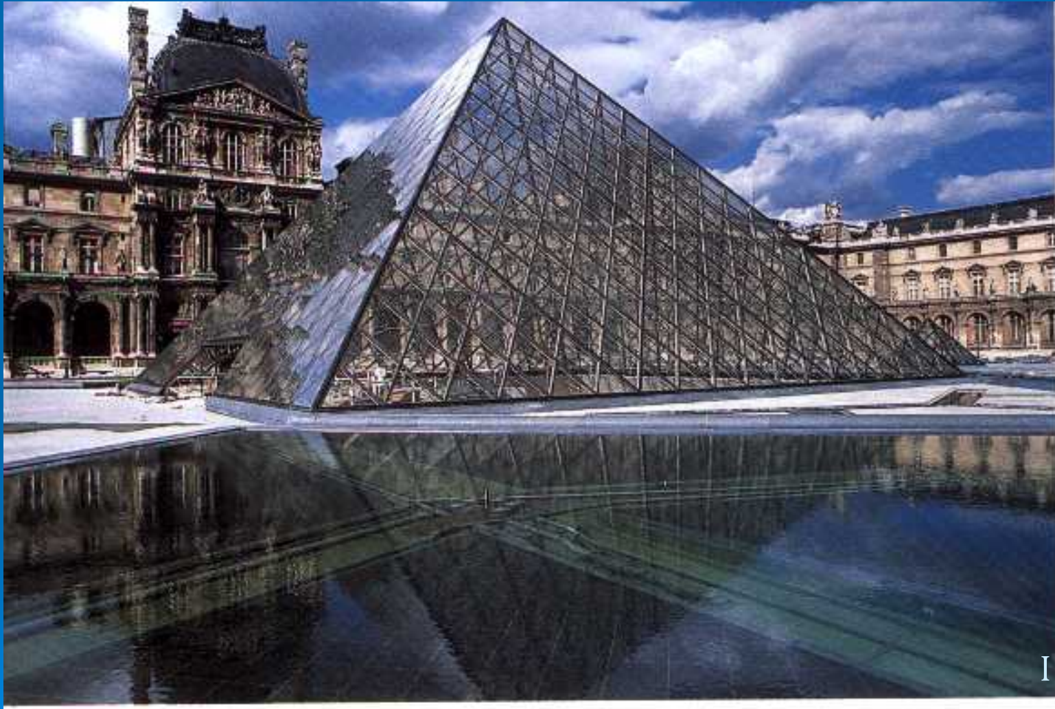
I M PEI, LOVURE PYRAMID, PARIS, 1983-1993