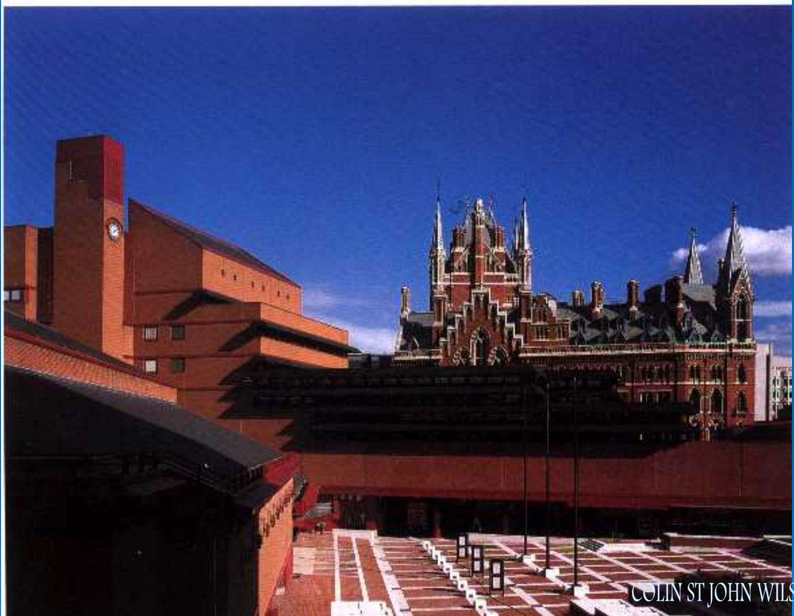
COLIN ST JOHN WILSON, NEW BRITISH LIBRARY, LONDON, 1963-1997