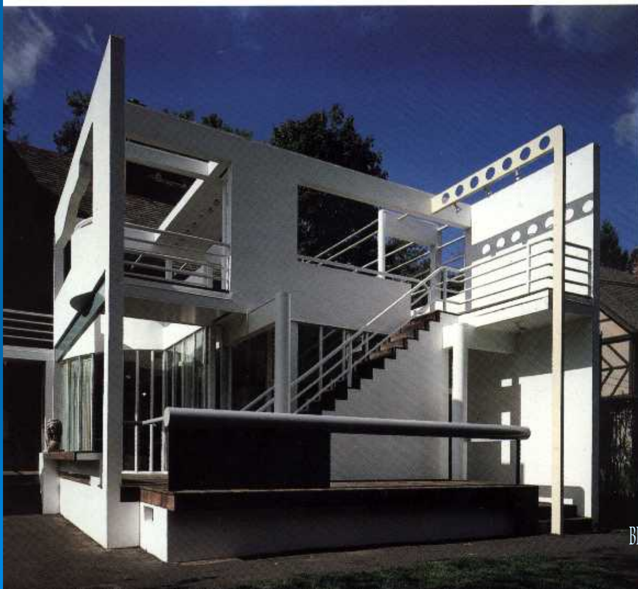
MICHAEL GRAVES, BENACERRAF HOUSE ADDITION, NEW JERSEY,