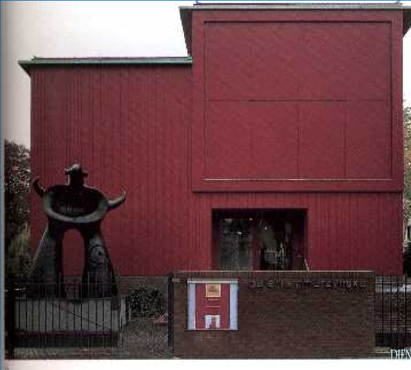
DIENER AND DIENER, GMURZYNSKA GALLERY, COLOGNE,