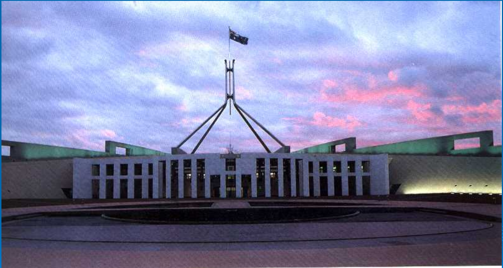
ROMALDO GIURGOLA, PARLIAMENT HOUSE, CANBERRA,