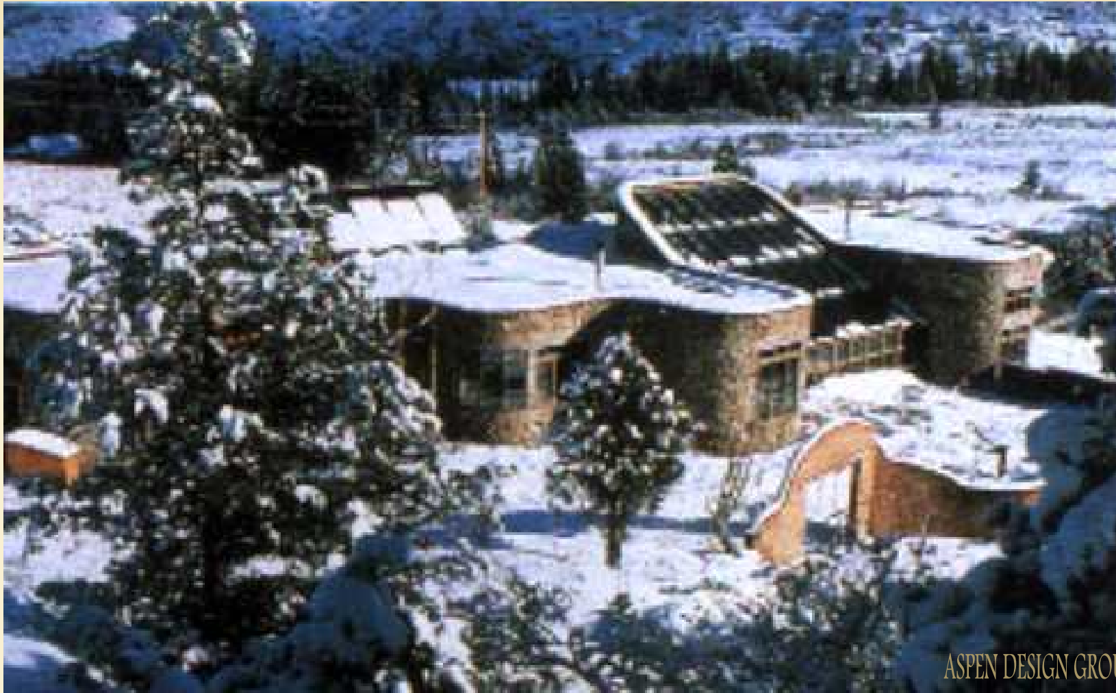
ASPEN DESIGN GROUP, ROCKY MOUNTAIN INSTITUTE, ASPEN, COLORADO,