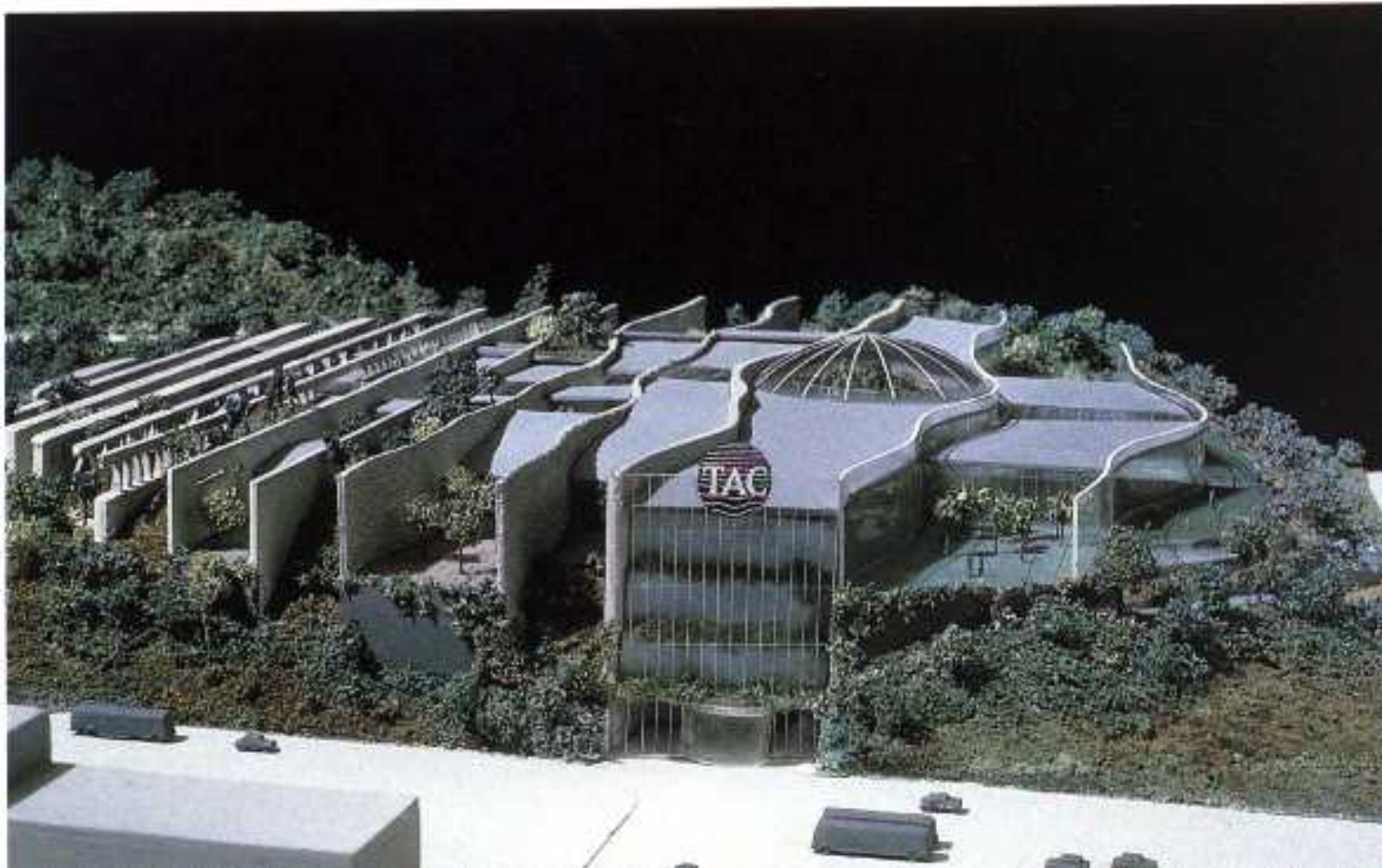
SITE, TENNESSEE AQUATORIUM, CHATTANOOGA PROJECT, 1993