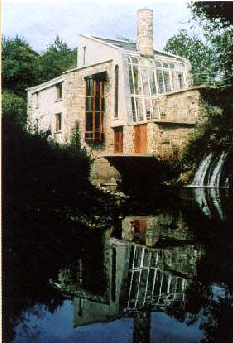
GAIA ASSOCIATES, WATERFALL HOUSE, COUNTRY MEATH, 1989-1990