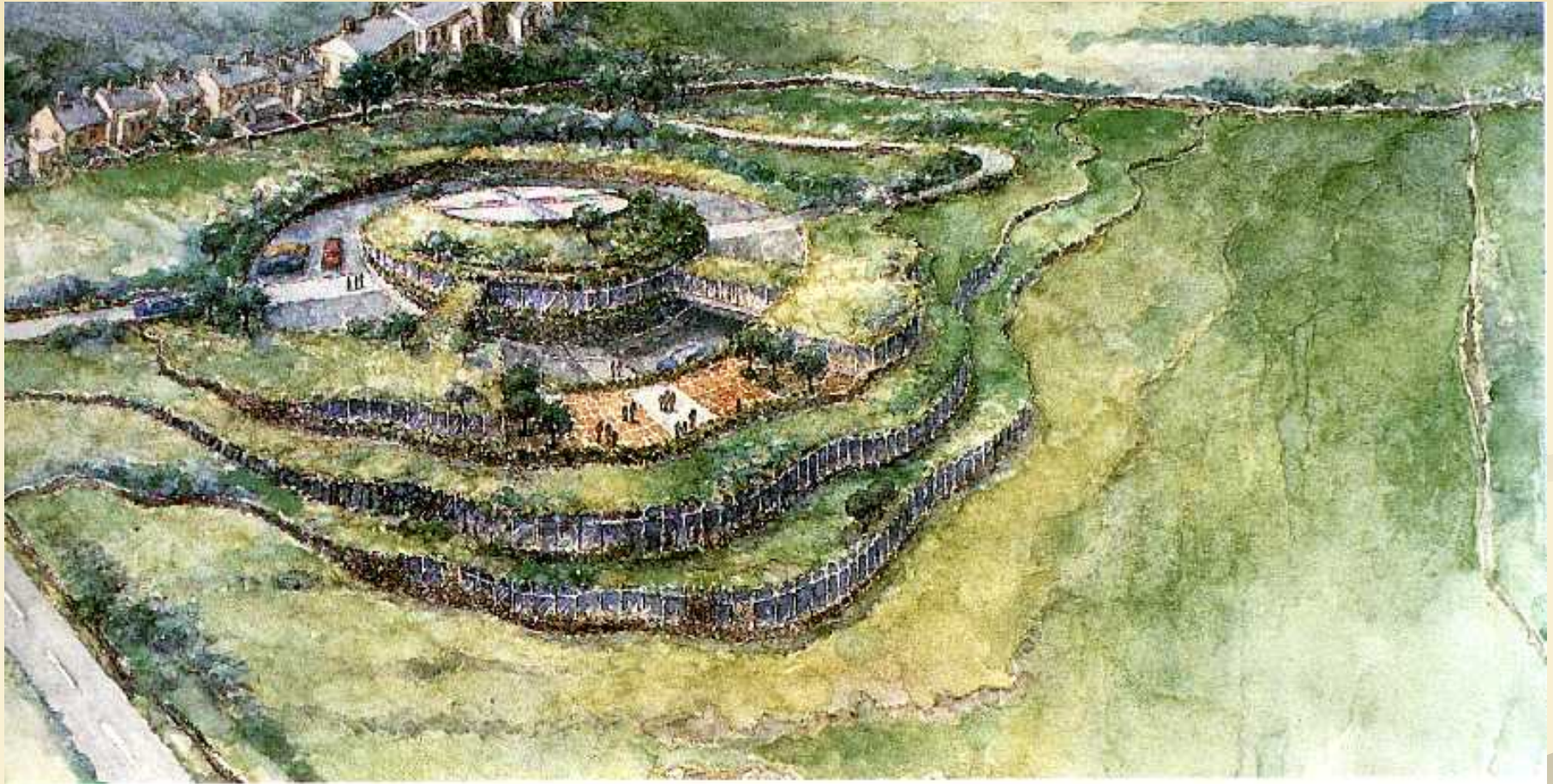
SITE, TIECC COMMUNICATION CENTER PROJECT, WALES, 1994