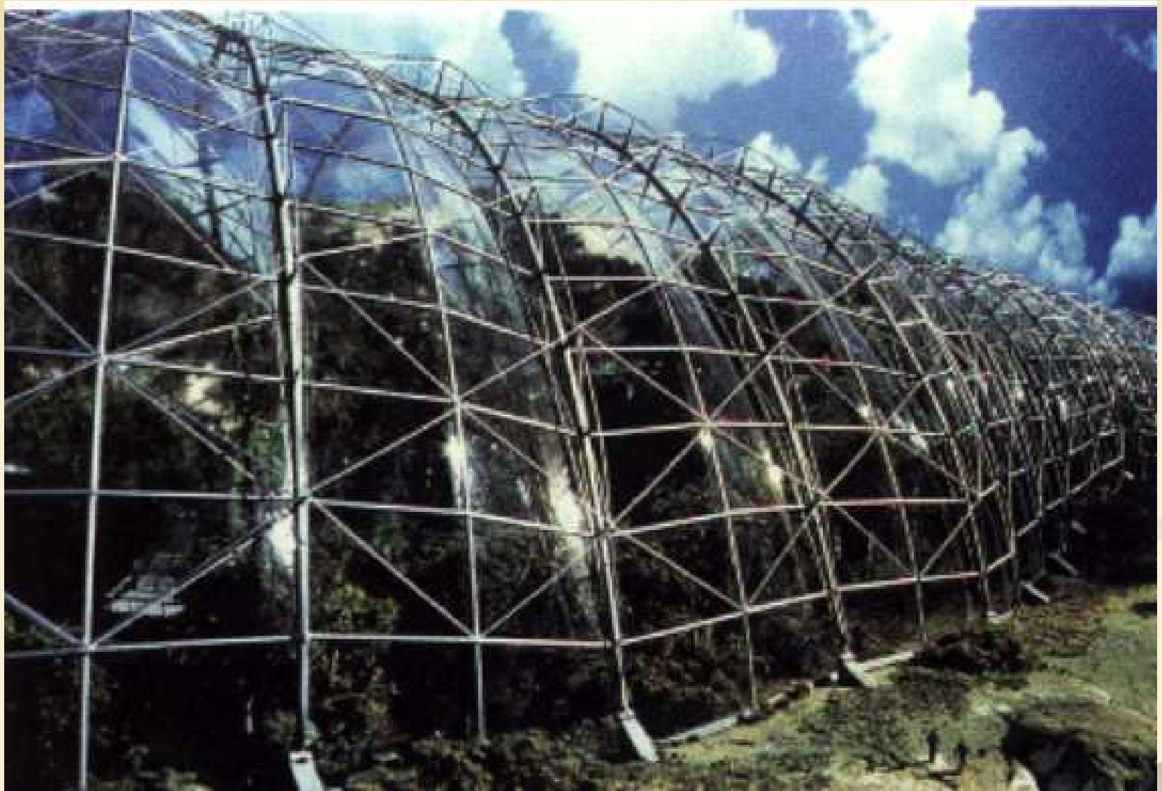
NICHOLAS GRIMSHAW, EDEN PROJECT, CORNWALL, UK, 1997-