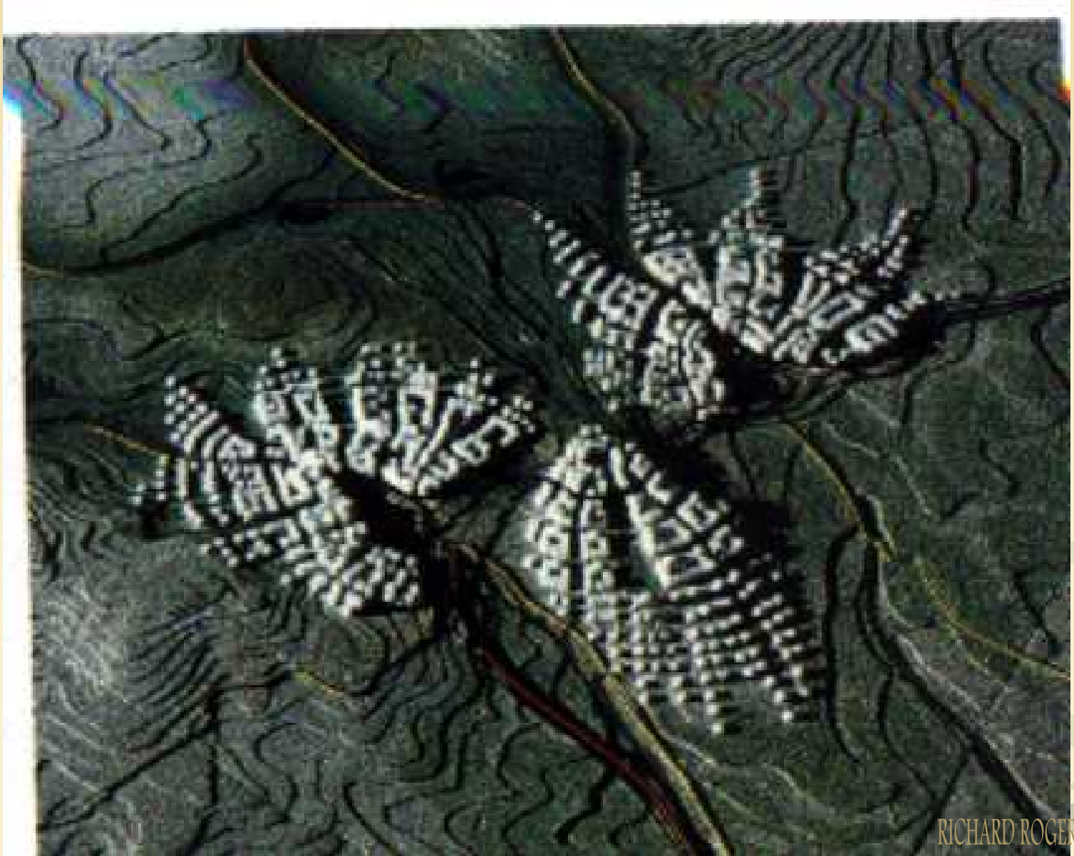
RICHARD ROGERS, MASTER PLAN FOR MAJORCA, NEAR PALMA,