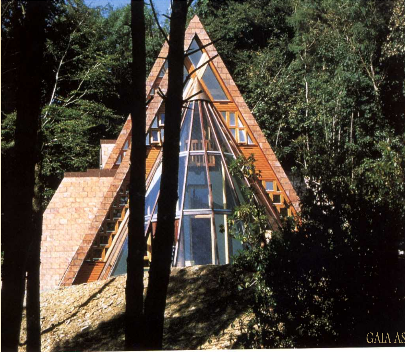
GAIA ASSOCIATES, ECO HOUSE, COUNTRY CORK, 1995-1996