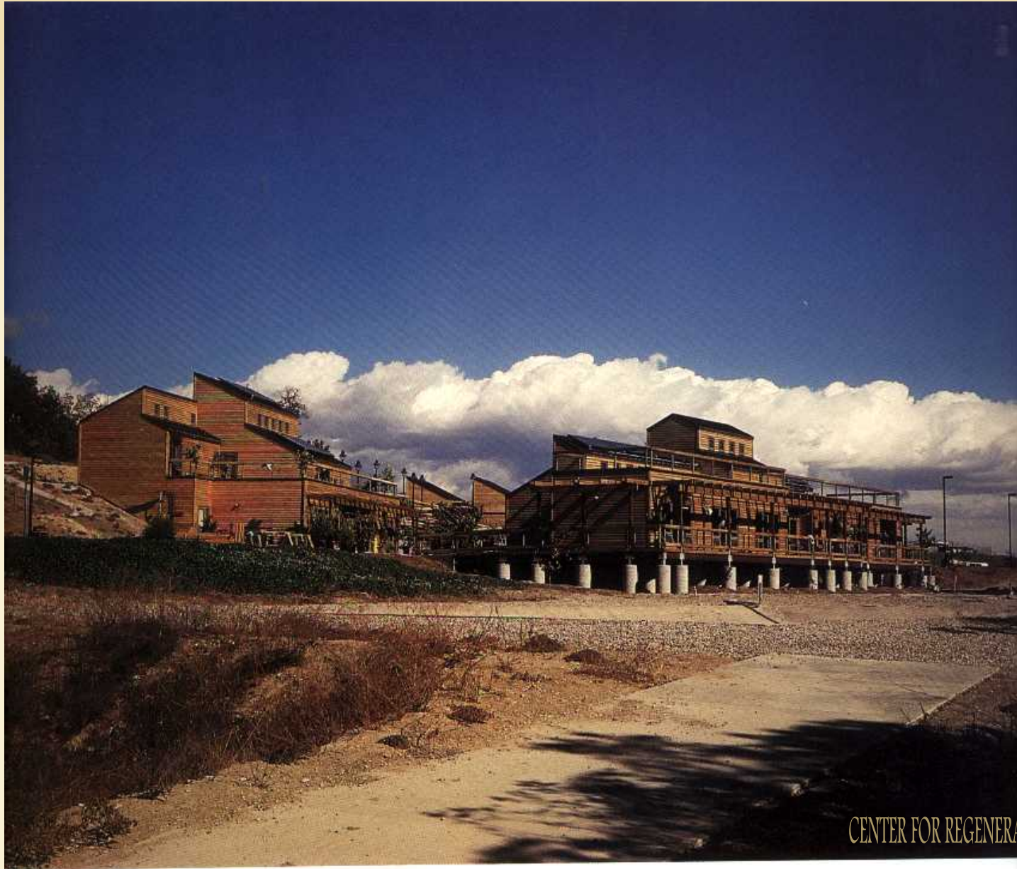
CENTER FOR REGENERATIVE STUDIES, CALIFORNIA STATE POLYTECHNIC UNIVERSITY, POMONA,