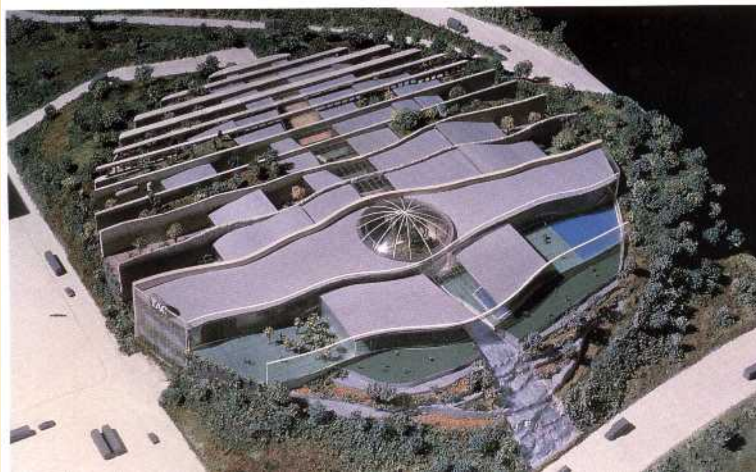
SITE, TENNESSEE AQUATORIUM, CHATTANOOGA PROJECT, 1993