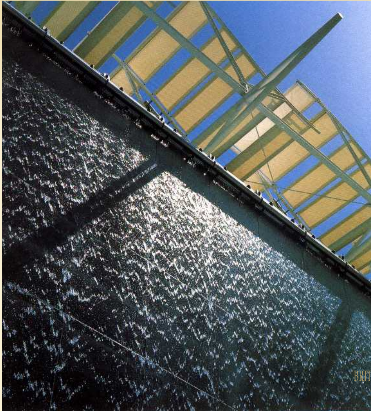
NICHOLAS GRIMSHAW, BRITISH PAVILLION, EXPO'92, SEVILLE,