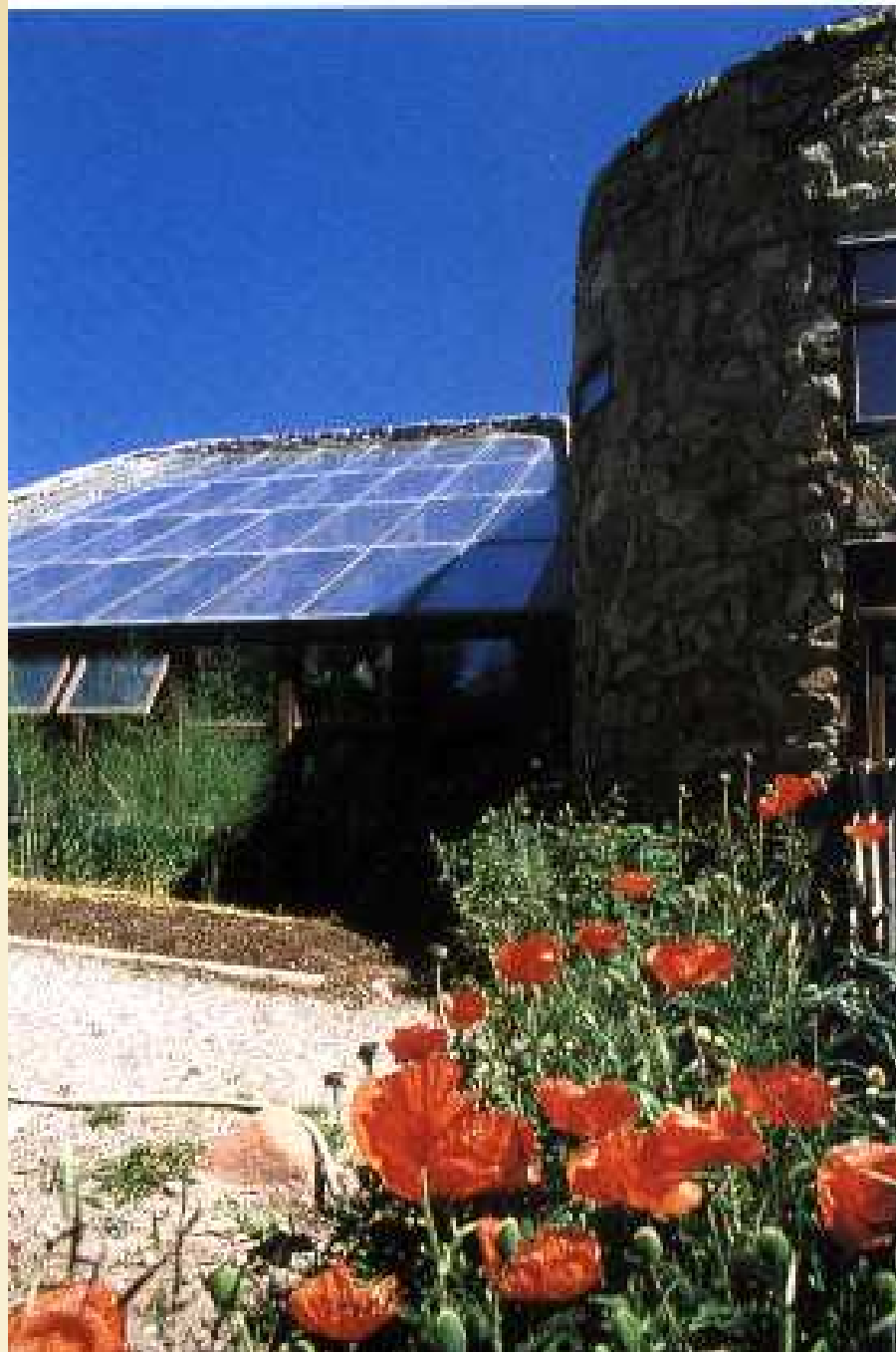
ASPEN DESIGN GROUP, ROCKY MOUNTAIN INSTITUTE, ASPEN, COLORADO,