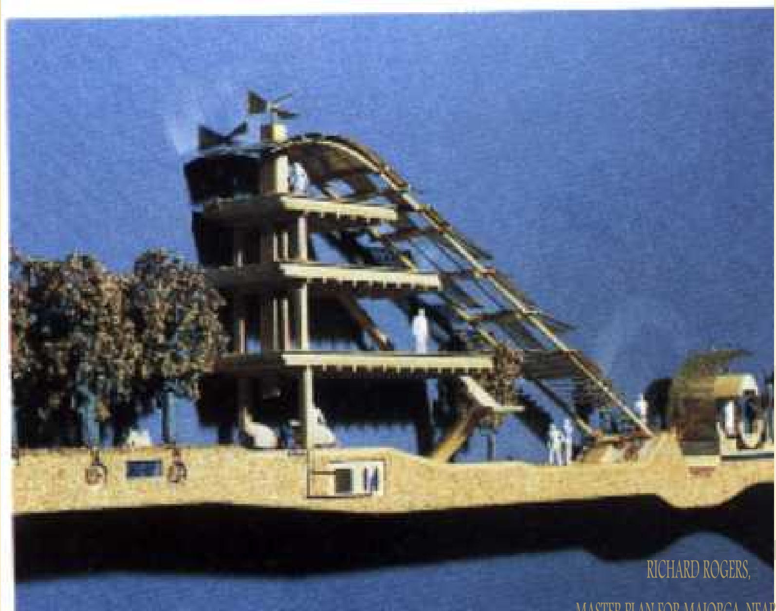
RICHARD ROGERS, MASTER PLAN FOR MAJORCA, NEAR PALMA,